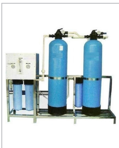
Water Softening Plant