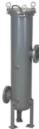
Duplex Cartridge Filter Housing