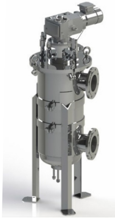
Self Cleaning Filter

PROVIDING YOU THE TOOLS FOR POWERFUL & EFFECTIVE FILTRATION SOLUTIONS. WE SUPPLY THE INDUSTRIAL MARKET PLACE WITH COMPETENT, COMPETITIVE & TIMELY FILTER SOLUTIONS.