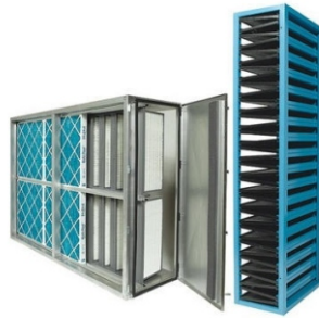
Bag Air Filter Housing