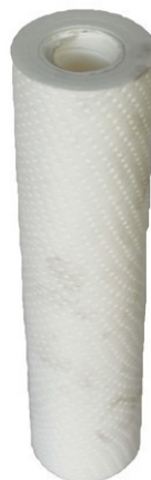
PP Filter Cartridge