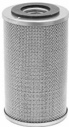
Hydraulic Fluid Filters Cartridge