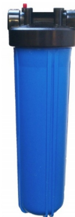
High Quality Polypropylene Filter Housing