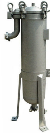
Bag Filter Housing