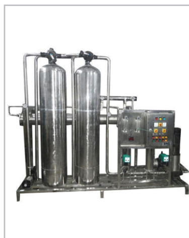
Stainless Steel RO Plant