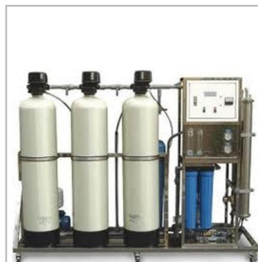
Demineralizes Water Plant