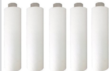
Spun Filter Cartridge