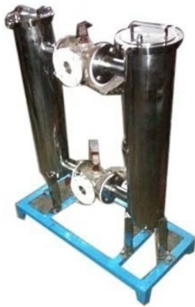
Duplex Bag Filter Housing