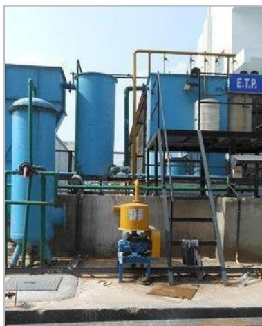
Effluent Treatment Plant