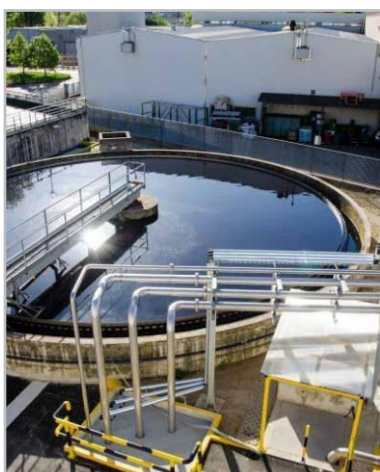
Wastewater Treatment Plant